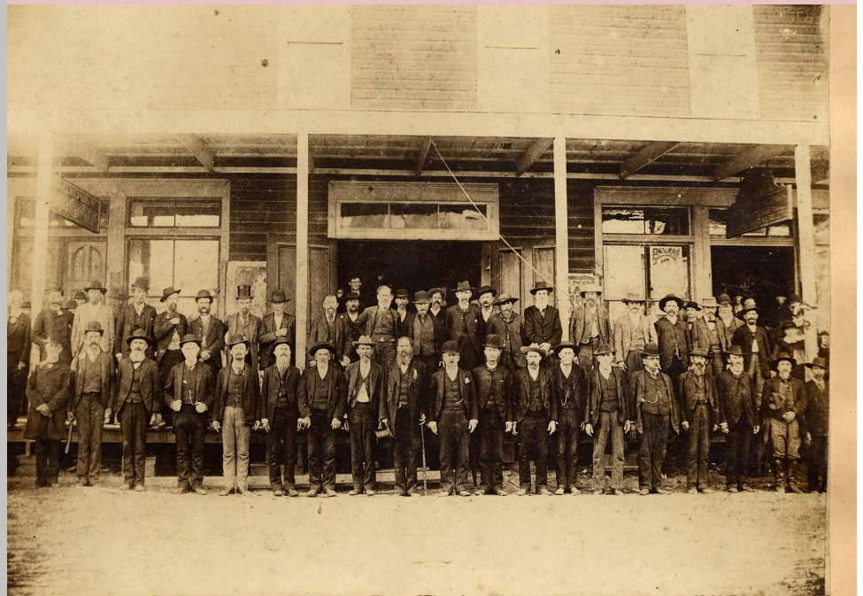
Calcasieu Camp No. 62, in 1888 in front of the old Williams Spunk House.

Amite City was incorporated in 1861, only months after secession. Camp Moore, located 10 miles north of Amite City in the village of Tangipahoa, was the largest Confederate training camp in Louisiana. During the War of Northern Aggression, Amite City was an important gathering place for Confederate officials involved in the supply and support of Camp Moore. In 1864, the railroad from Amite City to Camp Moore was burned and destroyed by Yankee invaders. Following the War, Amite City served as a base for Union occupiers during Reconstruction.